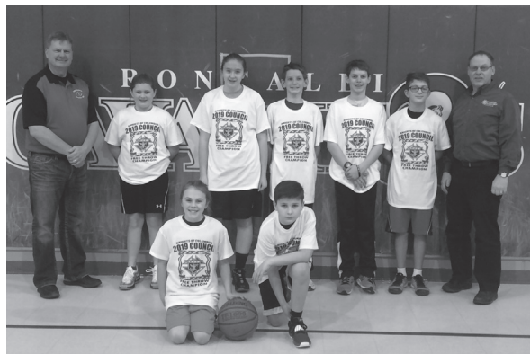
Local free throw champions